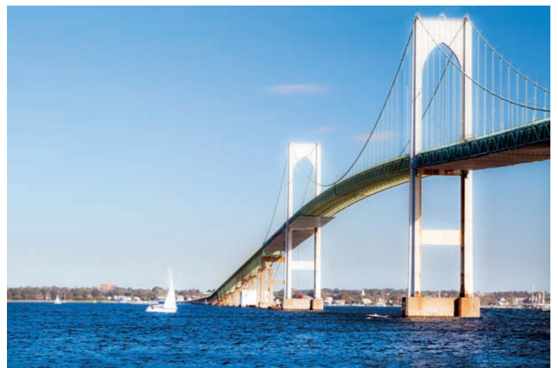
NEWPORT BRIDGE, NARRAGANSETT BAY