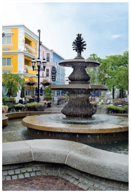
DEPASQUALE SQUARE, FEDERAL HILL, PROVIDENCE

features photographs of various Rhode Island landmarks that serve as distance markers for patients during rehabilitation therapy. Photographs are approximately 22 feet apart, and all photographs were taken by our own Fred DeGregorio. The goal of the trail is to establish mobilization goals for patients that are both fun and realistic. For example, it may not be uncommon to say to a patient in the morning of the second post-op day, "you made it to Water-Fire last night, let's try to make it to Del's Lemonade today."