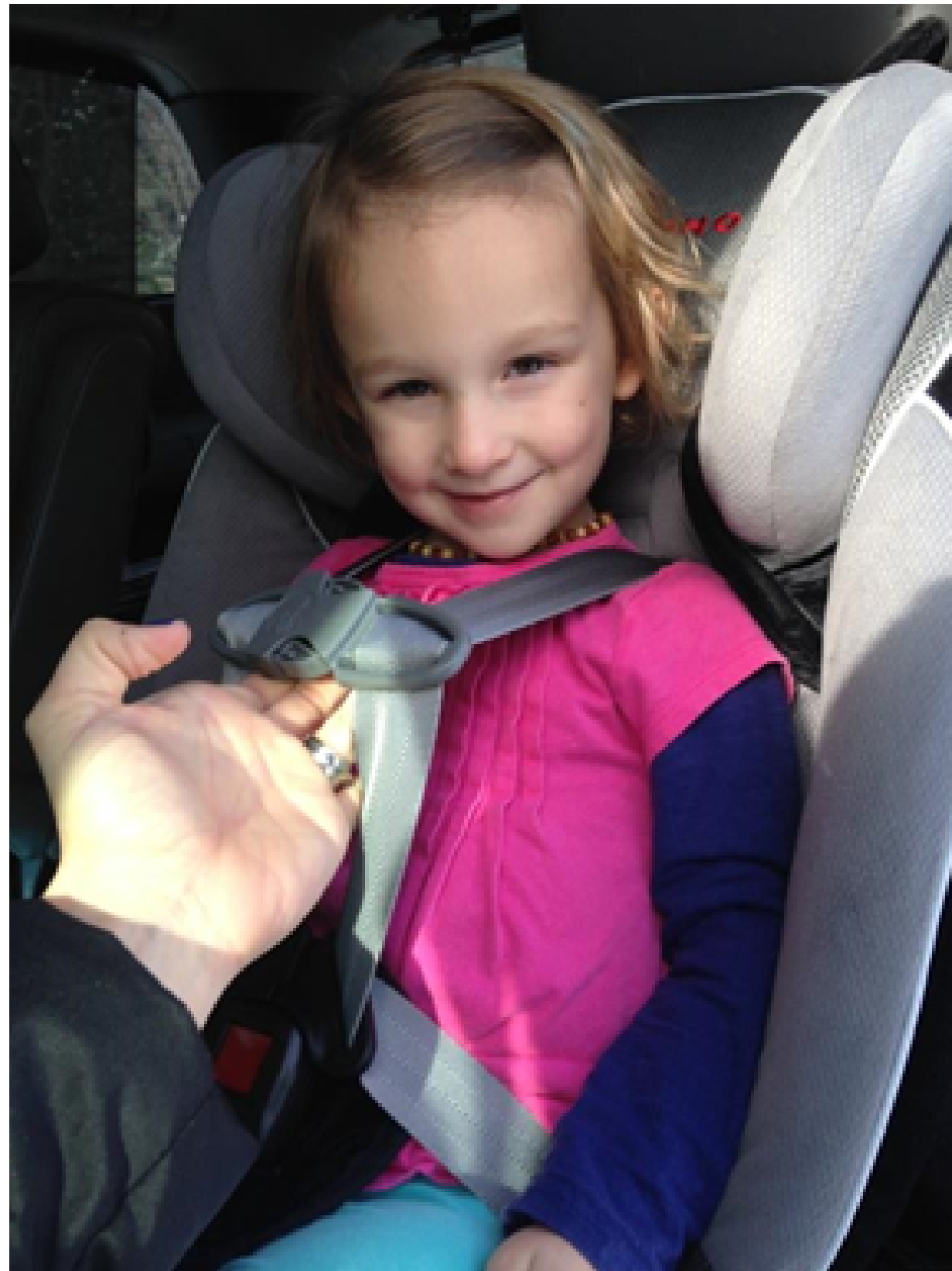
After coat was removed