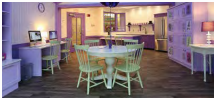
The Izzy Family Room

The Izzy Family Room is located on the 5th floor. This is a family space for both parents/caregivers and patients. The Izzy Foundation offers snacks, coffee, hygiene products and meals on most days. There is a kitchen, microwave, computers, television, and comfortable seating. For your convenience, the space is open 24 hours a day. Please ask the unit secretary for the access code