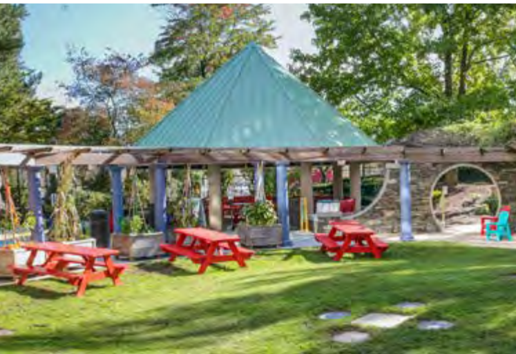
Balise Healing Garden

The pediatric garden was created to provide fun, diversion, and a change of scenery for our families. The entrance to our pediatric garden is on the lower level. It is open during daylight hours in the warmer months of the year. Check with your child's nurse before leaving the floor to visit the garden.