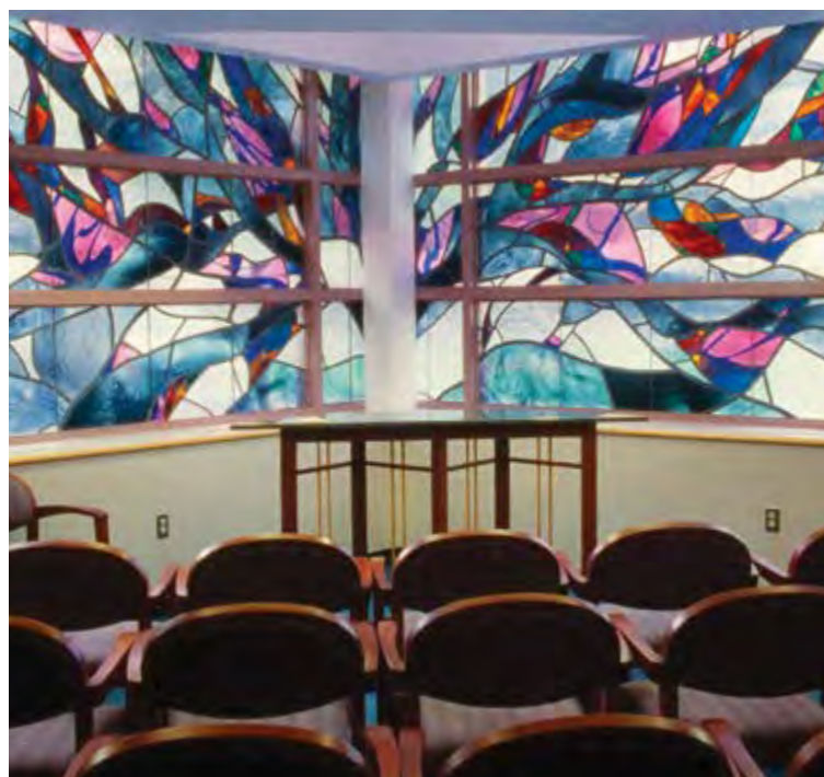
Hasbro Children's Chapel

Hasbro Children's has developed resources and programs to assist families who are coping with anticipatory grief or the loss of a child.