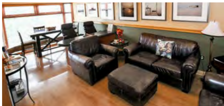
The Ronald McDonald Family Room

Located on the fourth floor, just off the elevators, the Ronald McDonald room offers a comfortable place for family members to grab a quick snack, rest, or even do laundry. For your convenience, the space is open 24 hours a day. Please ask the unit secretary for the access code. Laundry equipment is available based on volunteer availability.